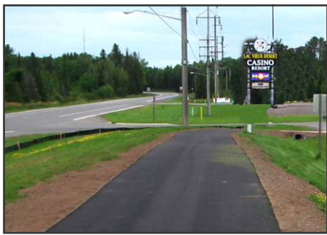
Phase II will complete the link of the Lac Vieux Desert Bike and Hike Trail from the Resort and Casino to the WLT System

LVD Bike and Hike Trail - After considerable engineering work, the Lac Vieux Desert Tribe will be soliciting bids this spring for Phase II of its Bike and Hike Trail which connects the LVD Resort and Casino, tribal housing and the Watersmeet School to the main Wilderness Lakes Trail loop. This segment includes construction of a 40-foot bridge over the Ontonagon River and 100+ feet of boardwalk.